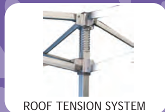
ROOF TENSION SYSTEM