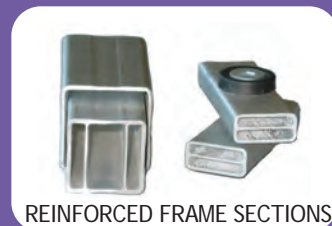
REINFORCED FRAME SECTIONS