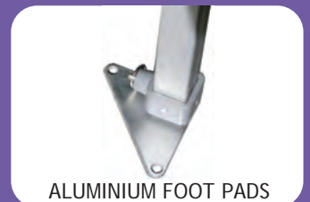
ALUMINIUM FOOT PADS