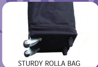
STURDY ROLLA BAG