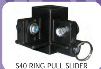
S40 RING PULL SLIDER