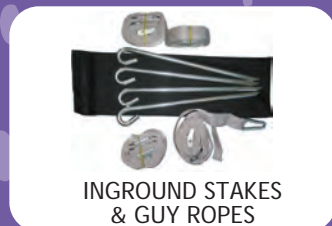
INGROUND STAKES & GUY ROPES