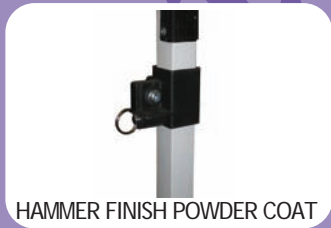
HAMMER FINISH POWDER COAT