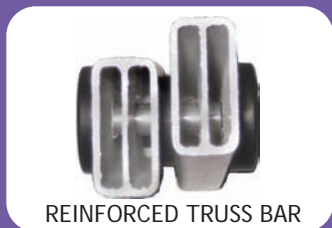
REINFORCED TRUSS BAR