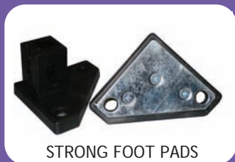
STRONG FOOT PADS