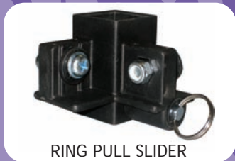
RING PULL SLIDER