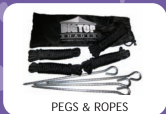
PEGS & ROPES