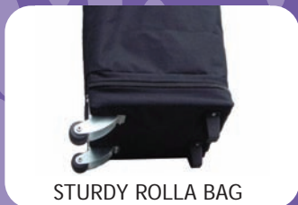
STURDY ROLLA BAG